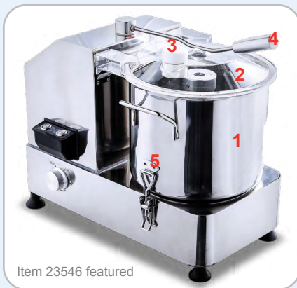
Item 23546 featured