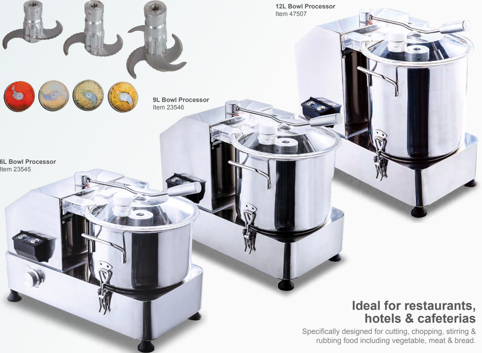
6L Bowl Processor Item 23545

Ideal for restaurants, hotels & cafeterias